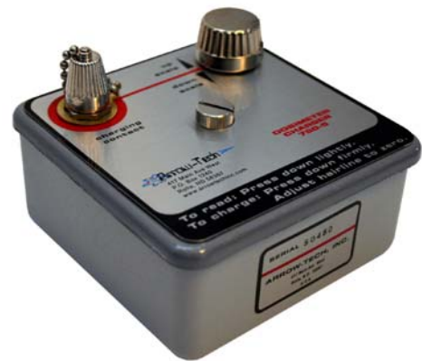
Model AT 750-5 charger (Battery not included)